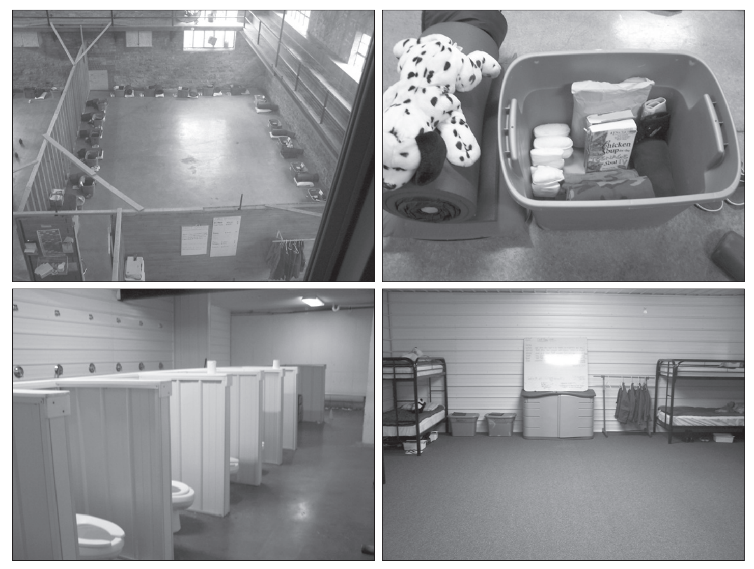
Figure 3: Interior of a Boot Camp Facility That GAO Visited