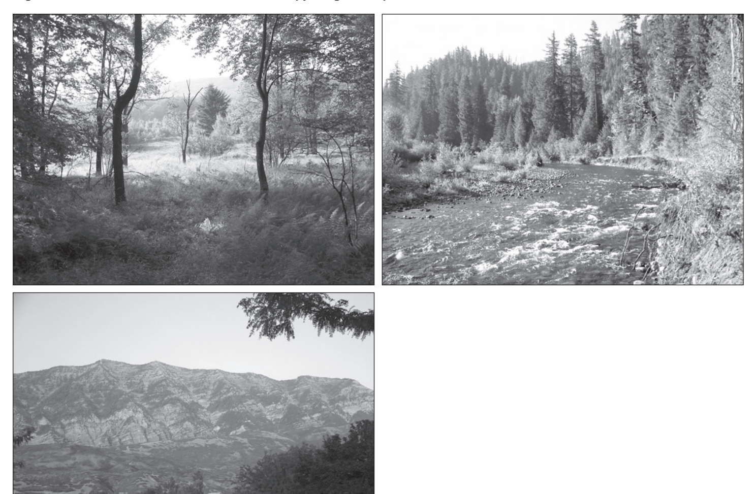
Figure 1: Environments Where Wilderness Therapy Programs Operate