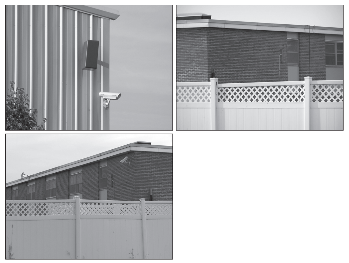
Figure 4: Security Features Employed at a Boarding School GAO Visited