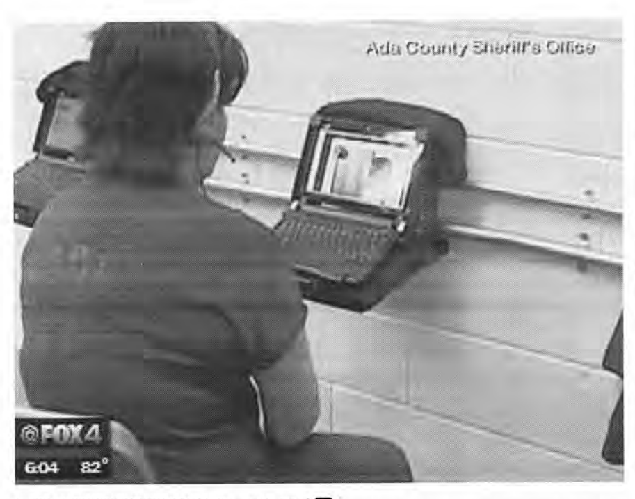
by BOB PRICE (/COLUMNISTS/BOB-PRICE) 17 Nov 2014 POST A COMMENT (/BREITBART-TEXAS/2014/11/17/DALLAS OUNTY-APPROVES-FOR-PROFIT-VIDEO-VISITATION-FOR-PRISONERS-IN-COUNTY-JAIL#COMMENTS)