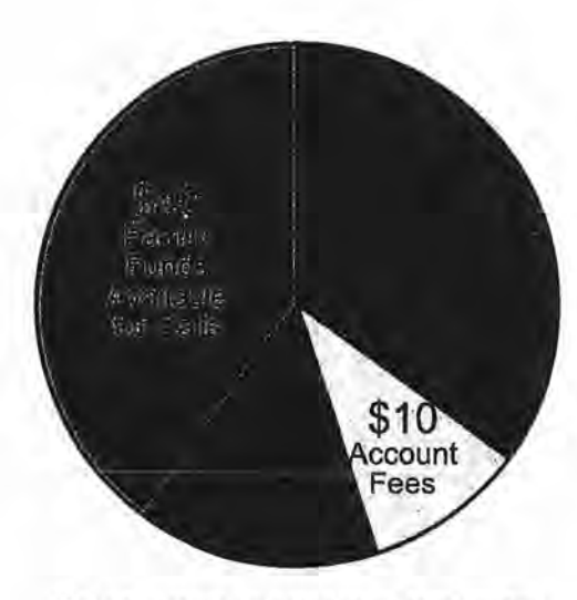
** The fees shown are based on public information gathered from vendor tariffs, recent proposals and/or company websites.

If a family has budgeted $100 for calls during a month, and they make a $25 payment each week using the vendor's website, how much money is available for calls?