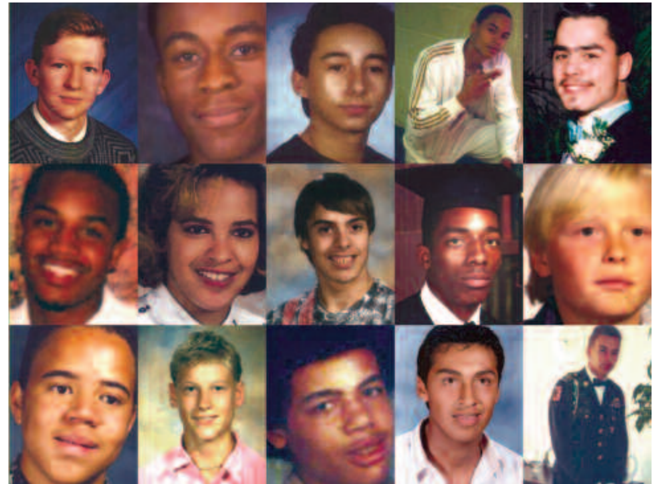
Youth who were sentenced to life in prison without parole.

In a recent opinion outside of the sentencing realm, the Supreme Court stated, “[o]ur history is replete with laws and judicial recognition’ that children cannot be viewed simply as miniature adults. We see no justification for taking a different course here.” 78