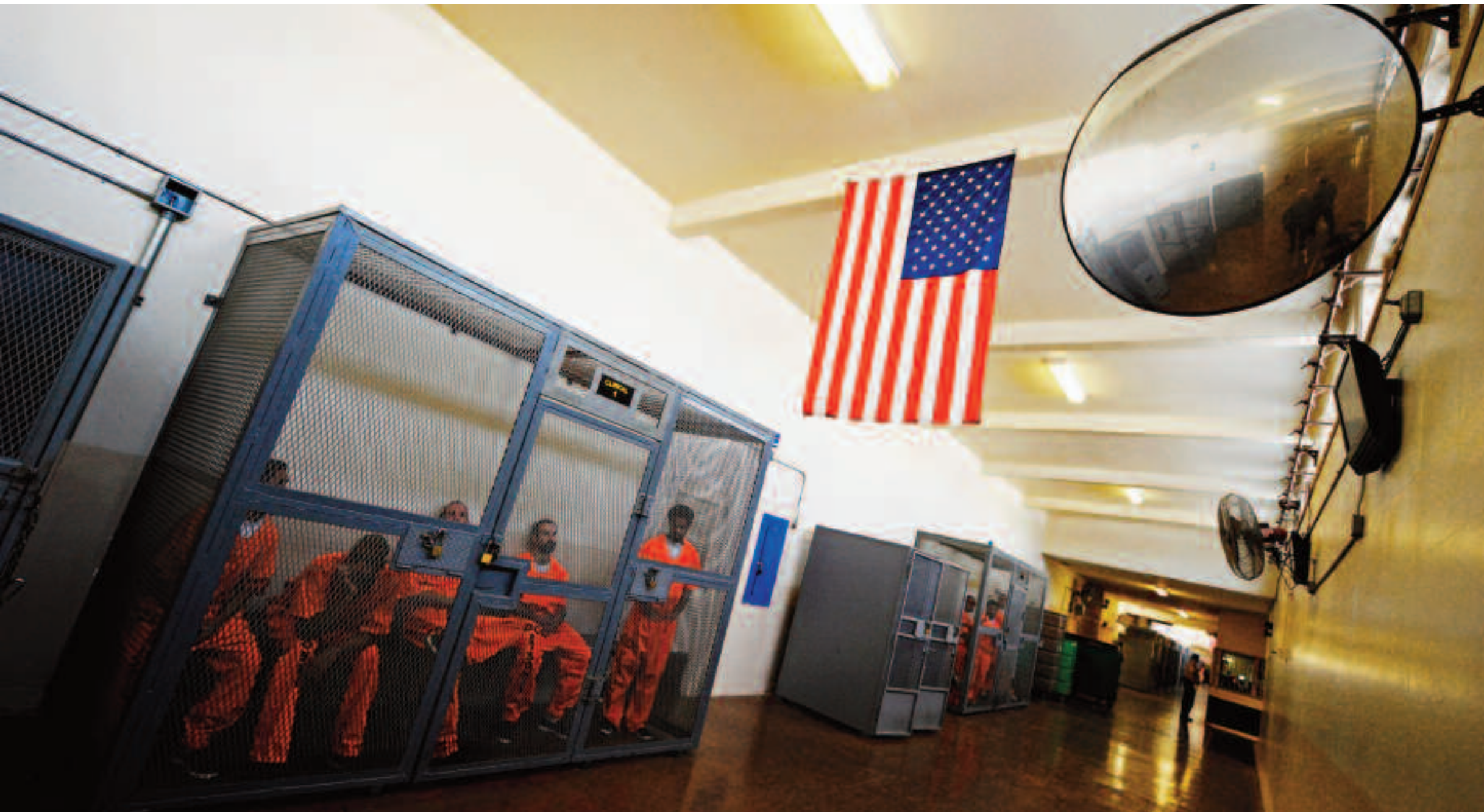
Inmates at Chino State Prison sit inside a metal cage in the hallway on December 10, 2010, in Chino, California.

more likely to be arrested for marijuana possession than a white person, even though African Americans and whites use marijuana at similar rates. 97 Although they are only 13 percent of the US population, 98 African Americans represent 31.7 percent of drug arrests, 99 40.7 percent of state prisoners serving time for drug offenses 100 and 43.7 percent of federal defendants serving time for drug offenses. 101