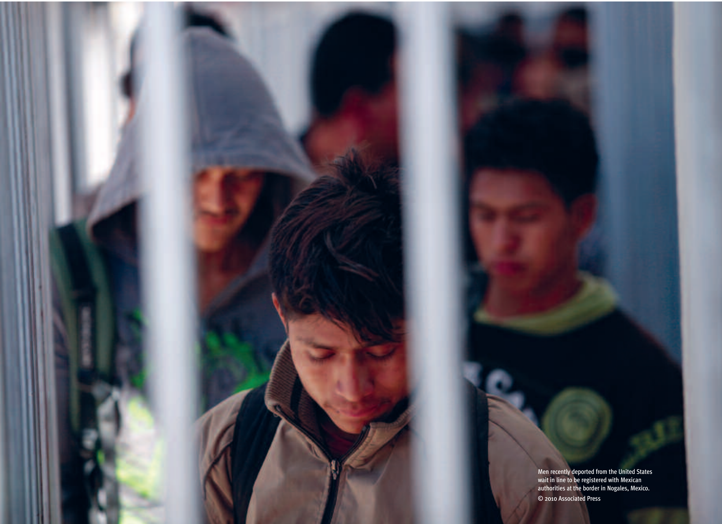
Men recently deported from the United States wait in line to be registered with Mexican authorities at the border in Nogales, Mexico.