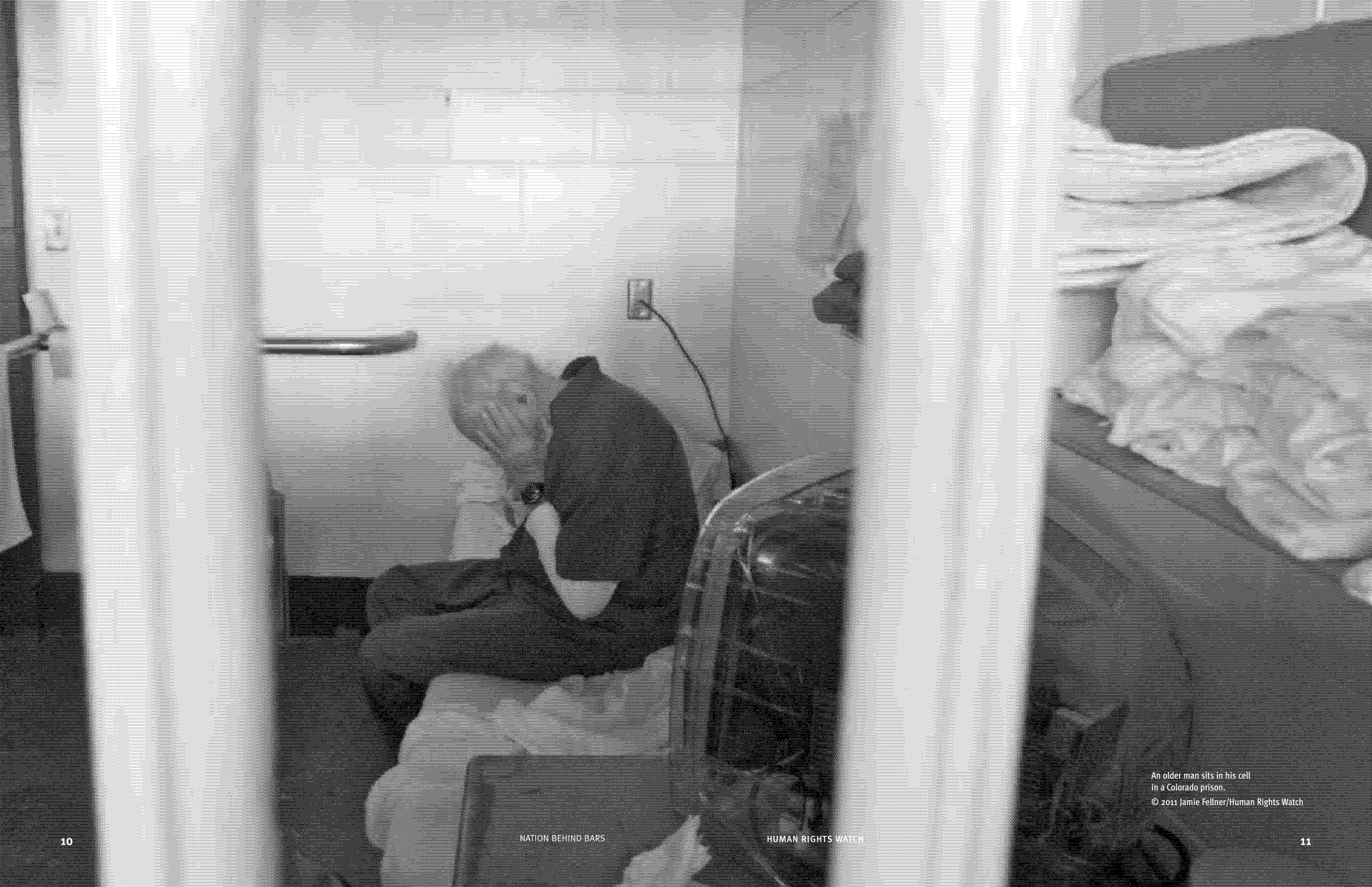
An older man sits in his cell in a Colorado prison.