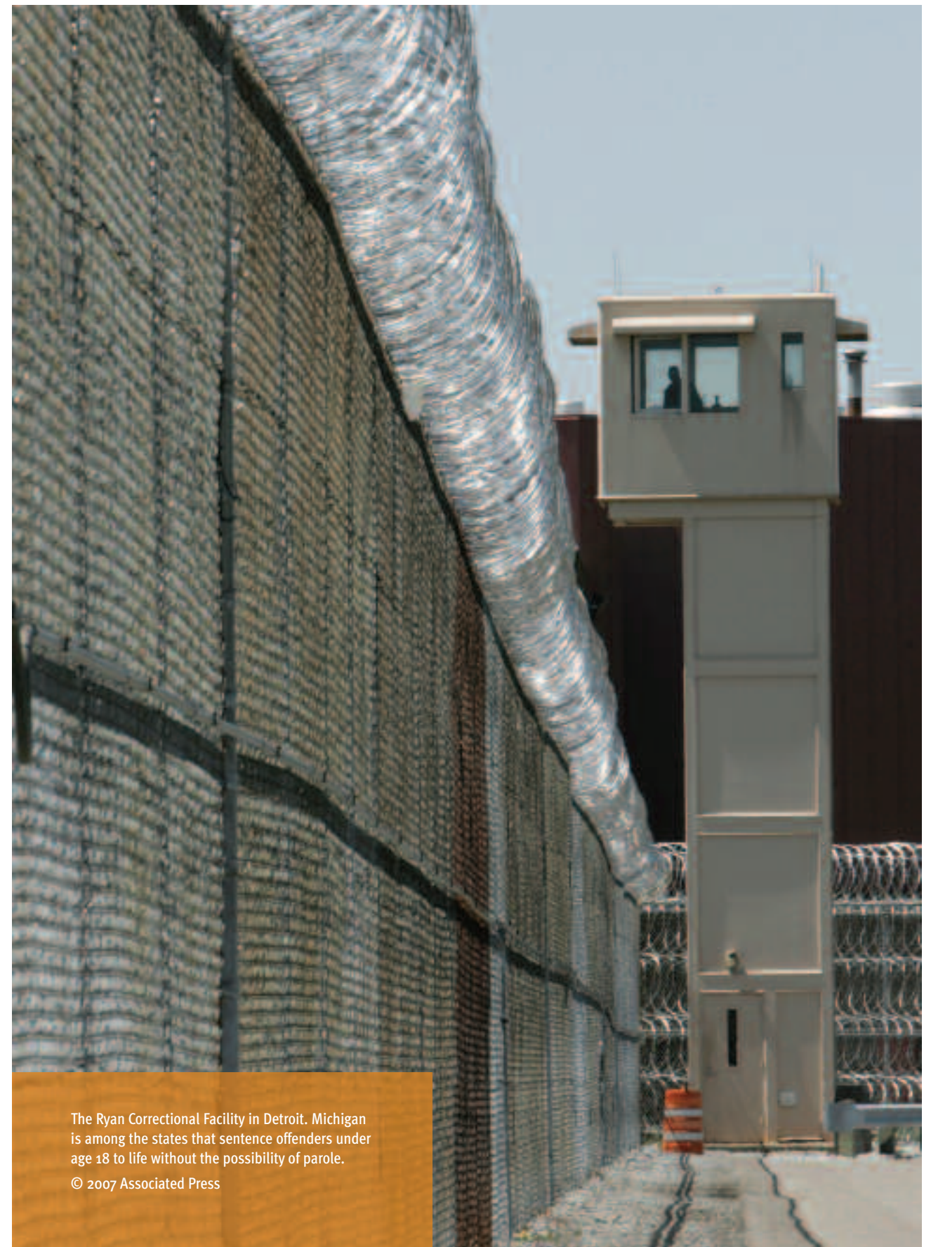
The Ryan Correctional Facility in Detroit, Michigan is among the states that sentence offenders under age 18 to life without the possibility of parole.

And in California, the state has instituted two new laws creating periodic review of youth sentences. The first, California Penal Code 1170(d)(2), allows a judge to review the case of someone who was under 18 the time of a crime and sentenced to life without parole. Under the new law, the court may impose a sentence of 25-to-life instead, offering youth the possibility of parole. The second, California Penal Code 3051, creates a new parole process for youth convicted as adults and sentenced to adult prison terms. The "Youth Offender Parole" process takes into account the age of an offender at the time of the crime and provides the possibility of early release from prison based on growth and maturity. The new law requires the board of parole hearings to give a "meaningful opportunity" of release to youth sentenced to adult prison terms.