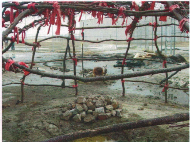
View of sweat lodge February 6, 2009