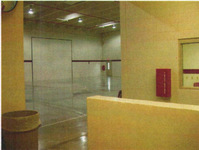
View from brick partition looking towards gym video monitor February 6, 2009