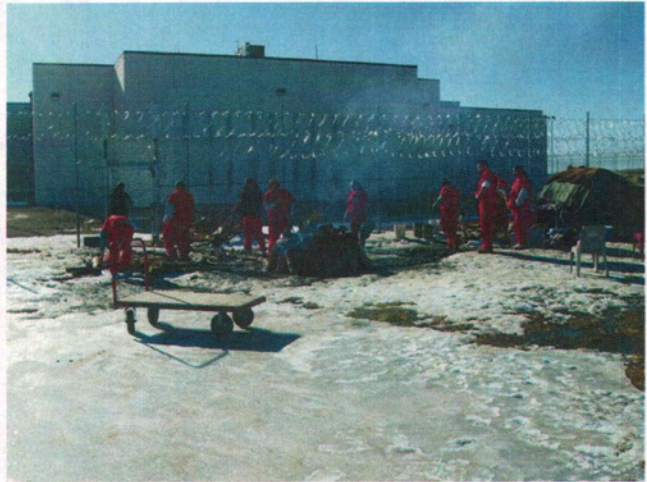
Inmates at sweat lodge ceremony date unknown