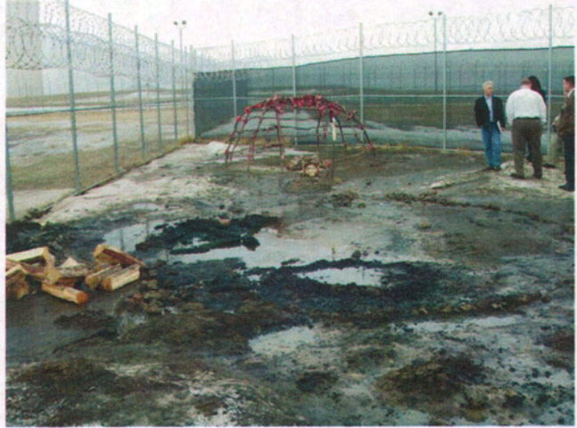
Current sweat lodge area February 6, 2009