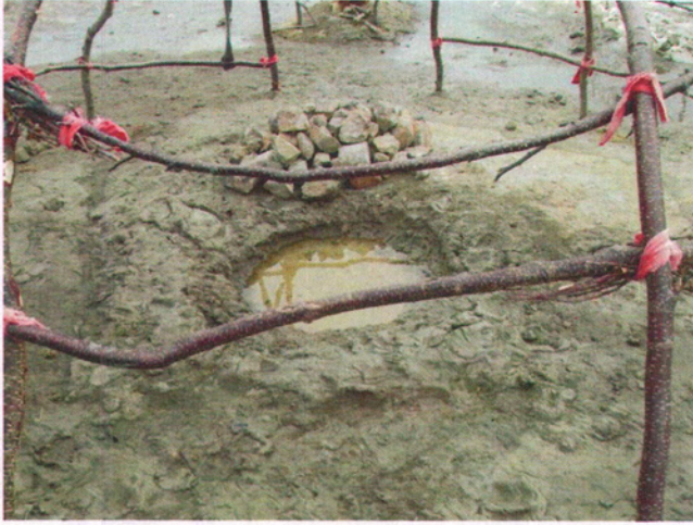
Interior of sweat lodge February 6, 2009