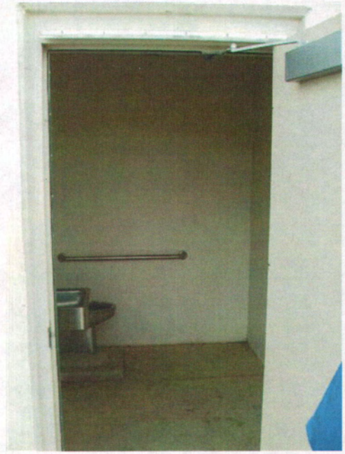
Recreation area bathroom February 6, 2009