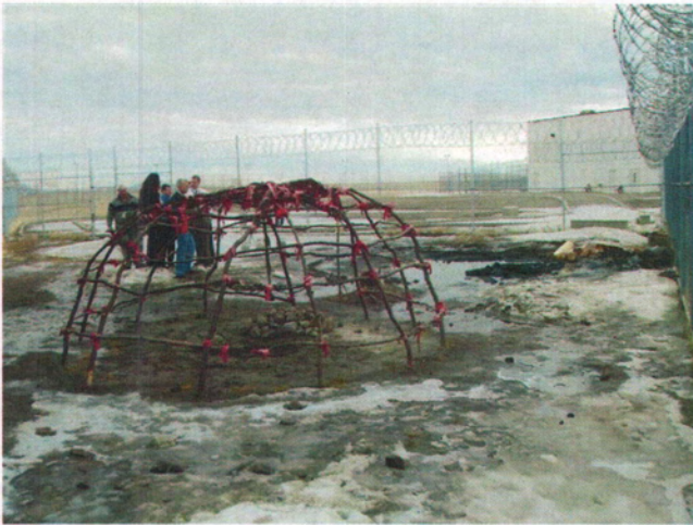
View of sweat lodge area looking towards the recreation area bathroom February 6, 2009