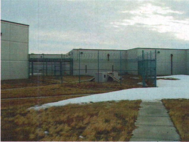
Area of old sweat lodge grounds February 6, 2009