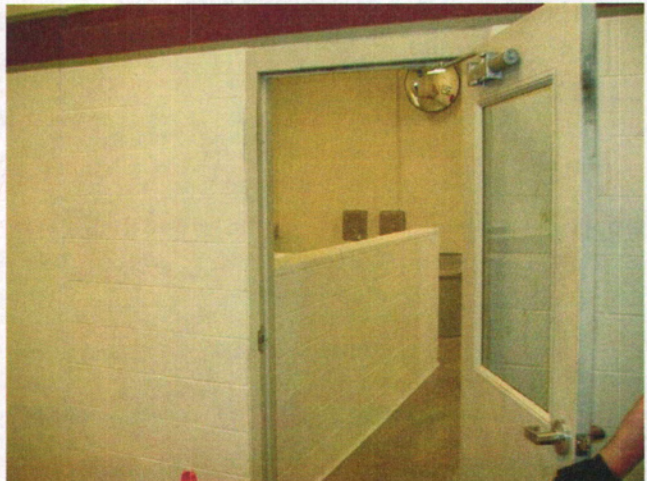
View from hallway into gym entryway showing brick partition February 6, 2009