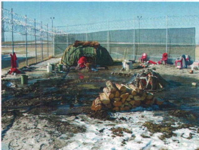
Inmates at sweat lodge ceremony date unknown