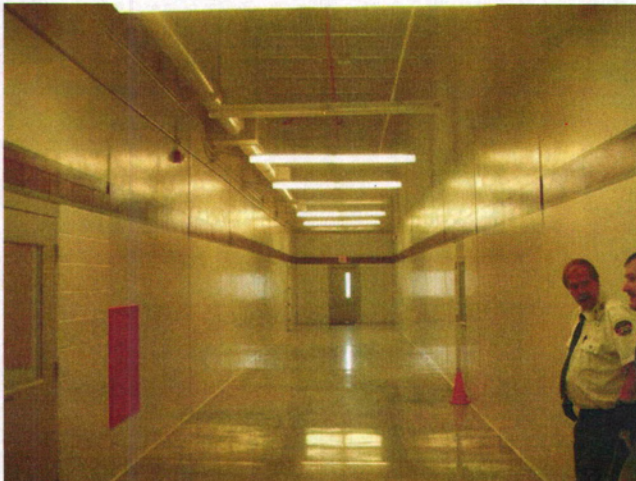
Hallway leading to recreation area February 6, 2009