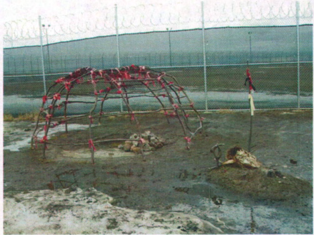
Sweat lodge area February 6, 2009