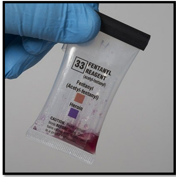
Sample Pouches Containing Ampoules with Liquid Chemical Reagents (Sirchie)