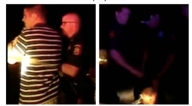
Figure 4. Case 8: still frames taken from video by police camera before and after TASER X26 administration. Initially, the man struggled with police (left). Off camera, he received X26 shocks of 21-, 7-, and 3-second duration and was then brought back into the video field by police (right). He was nonresponsive and gasping for breath, most likely agonal breathing. Note head at bottom of frame when he was unconscious, likely due to ventricular fibrillation. For full video, see Movie I in the online-only Data Supplement.