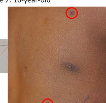
Figure 2. Left, Picture of 12.2- and 13.2-mm TASER X26 darts used in case 7 after removal from the skin. Right , Picture of TASER X26 dart marks (circles) above and below the left nipple of case 7. The head is at the top.