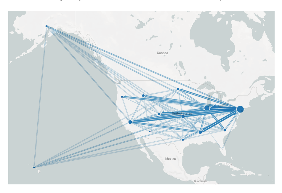
Figure 3: Interstate Prisoner Transfers in 2019<sup>180</sup>

It is difficult to discern which of these pathways is most traveled because many states deemed the number of prisoners they sent to each state confidential. But it is clear that this is a national network. Colorado ships prisoners not only to Arizona, Kansas, and Utah, but also to Alaska and Maine. New Jersey sends prisoners to California, Florida, and Missouri. In other words, this is more than a few cases of sharing between contiguous states. Transfers often involve extraordinary distances: using conservative figures (and crow-fly distances rather than the likely longer distances visitors would have to drive on existing roads), the average length of an interstate prison transfer in 2019 was 1252 miles, almost twice the width of Texas. The movement of