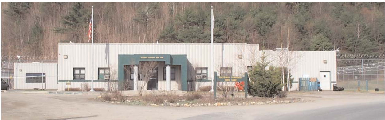
Caledonia Community Work Camp in St. Johnsbury.