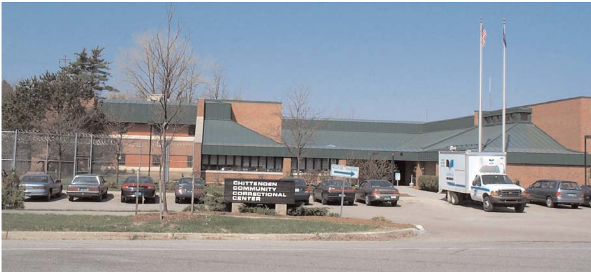
Chittenden Regional Correctional Facility in South Burlington.