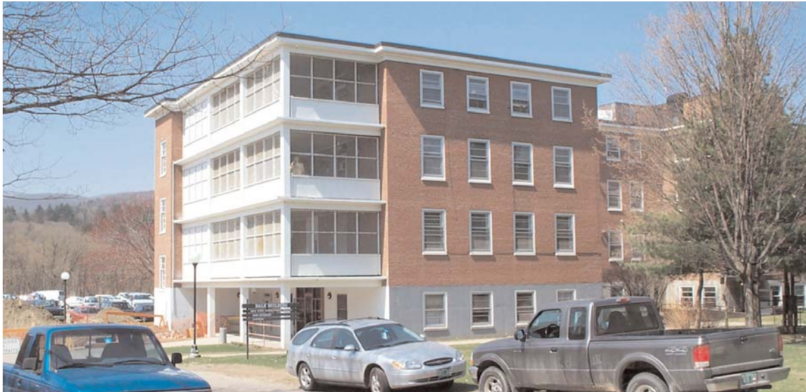
Dale Correctional Facility in Waterbury.