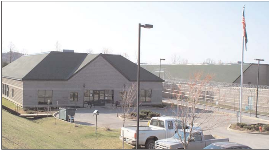
Northern State Correctional Facility in Newport

“Ideally, there should be continuous and thorough dialogue between prisoners and prison officials regarding the conditions of confinement. This would enable the managers to be fully informed when they made their decisions on facility operations. Unfortunately, too many prison administrators think they are all-knowing, and they view prisoner input negatively. In the past couple months I have witnessed several incidents of retaliation against concerned prisoners at this facility.”