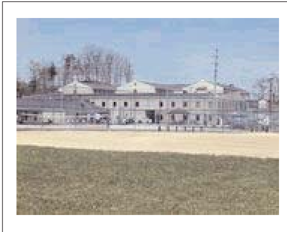
Lee Adjustment Center Beattyville, Kentucky.