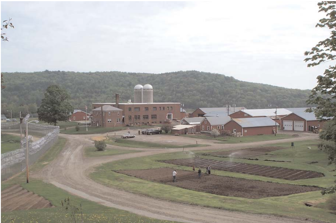
Southeast State Correctional Facility in Windsor.

Both 3 V.S.A. §342 and Bulletin No. 3.5 require that before going out to bid, departments must determine that the cost of providing the service is a savings to the State, that the contract is not burdensome on State personnel to oversee and monitor, and that the service could not be done more effectively by State personnel. The DOC may find it useful to conduct such an evaluation before the close of each contract to determine if the services need to be re-bid, or if using State personnel would be more cost-effective.