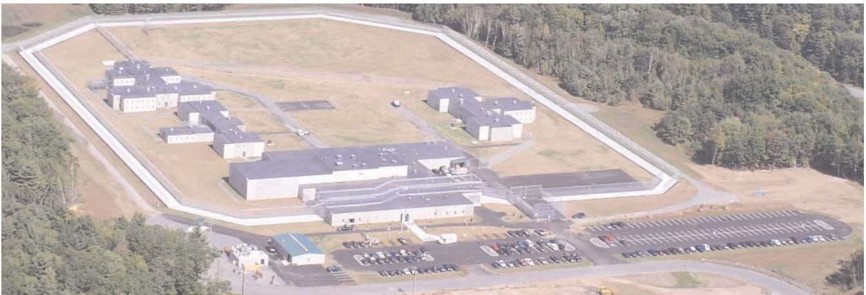
An aerial photo of the Southern State Correctional Facility in Springfield.