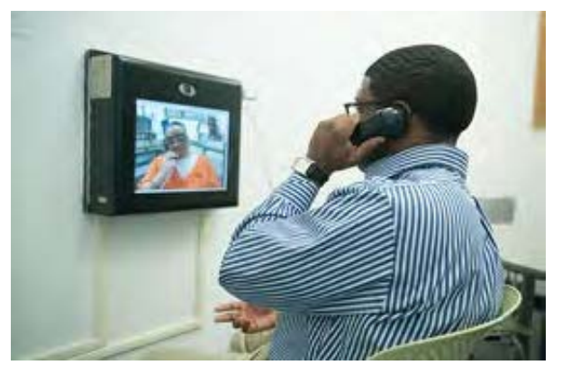
FIGURE 1-COMMUNITY BASED VIDEO VISITING CENTER AT DEANWOOD COMMUNITY CENTER