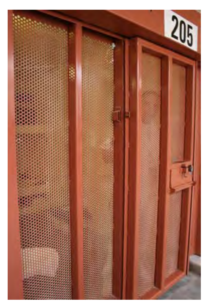
A SHU inmate peers out of his cell.

stimulation", including, where possible, more out-of-cell time and opportunities to exercise in the presence of other prisoners (23-3.8 (c)). The standards also recommend a number of procedural protections for prisoners placed in segregated housing, including a hearing at which the prisoner has a reasonable opportunity to present witnesses and information and to participate in the proceedings, with regular, meaningful review (23-2.9).