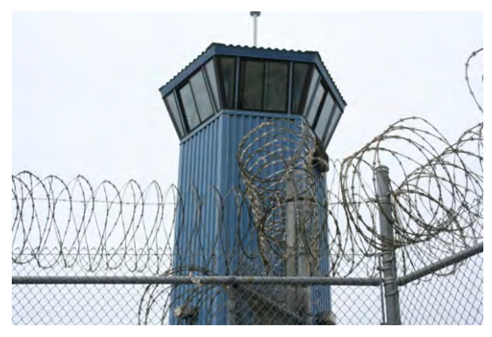
A watchtower at Pelican Bay State Prison.

California is one of more than 40 US states to house prisoners in high security isolation facilities, often termed "super-maximum security" prisons. Although no exact data is available, as many as 25,000 prisoners are estimated to be held in such facilities, with thousands more held in solitary confinement for varying periods in disciplinary or administrative segregation cells at any given time.<sup>4</sup> While prison authorities have always been able to segregate prisoners for their own protection or as a penalty for disciplinary offences, super-maximum security facilities differ in that they are designed to remove large numbers of prisoners from the general prison population and confine them long-term to isolation cells as an administrative control measure. States started building such prisons (or units within prisons) from the late 1980s, with the largest expansion during the 1990s.<sup>5</sup>