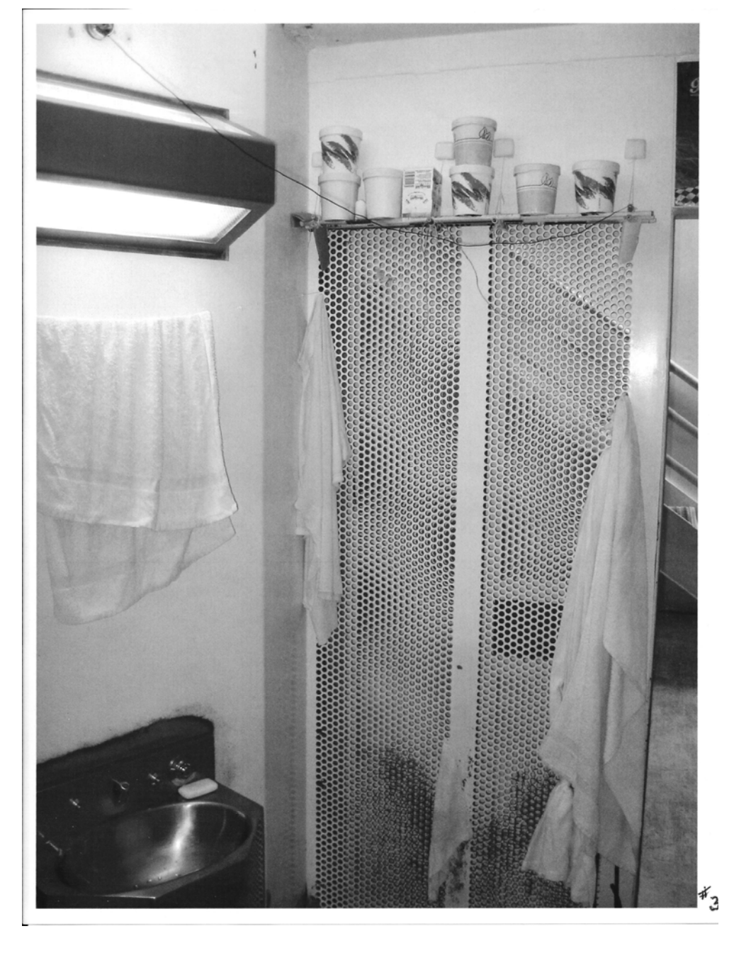
Picture taken inside a SHU cell showing a sink and typical canteen food.