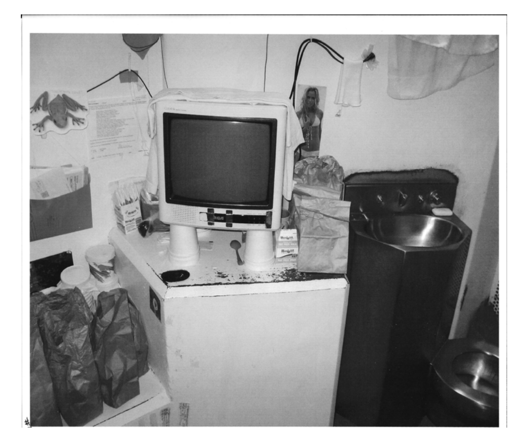
Picture of a sink and tv inside a SHU cell.

While the perforated doors allow entrance of some fresh air, prisoners have complained of cells becoming very cold in winter, particularly at night, and of not being provided with adequate clothing. The cold temperature is reportedly exacerbated by failure to insulate outside walls at the back of some cells, where the concrete bunks are situated. There are also reports that the ventilation system is inadequate, consisting of recycled air, releasing dust and particles, leading to respiratory problems.<sup>48</sup> While Amnesty International was unable to assess this through its visit, it believes that these complaints should be addressed. CDCR should ensure that cells are sufficiently insulated from cold, are maintained at adequate temperatures and with sufficient ventilation. All prisoners without exception should be provided with adequate clothing, blankets and headwear.