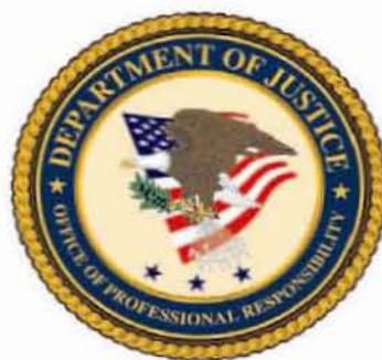
U.S. Department of Justice Office of Professional Responsibility