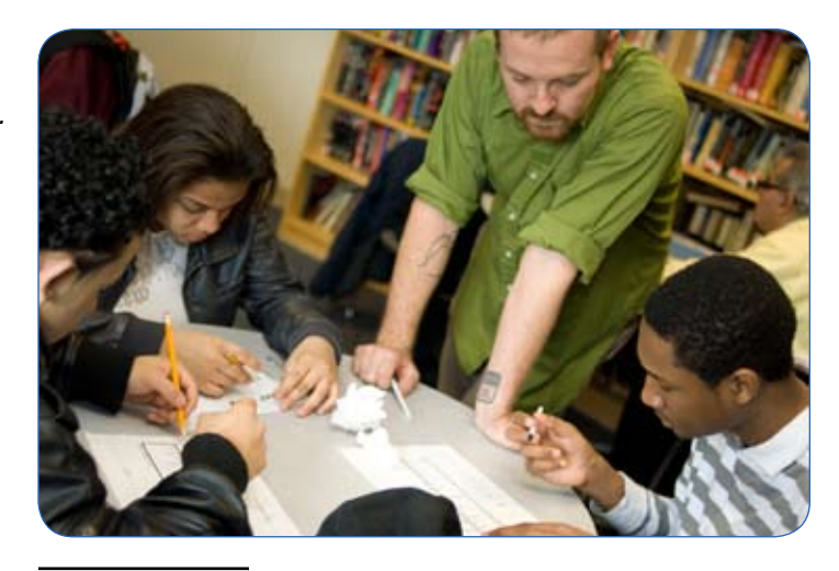
17 Fortune also nudges its employees to attain higher education degrees and provides an amount for tuition reimbursement.

Employees are constantly nudged to increase their skill sets with training and formal education. <sup>17</sup> One staff member's comment reflected internalization of this value: "Here your rap sheet is part of your resume. But, it is not enough. You need the combination of the two: the academics and the life experience." Accordingly, Fortune offers a robust