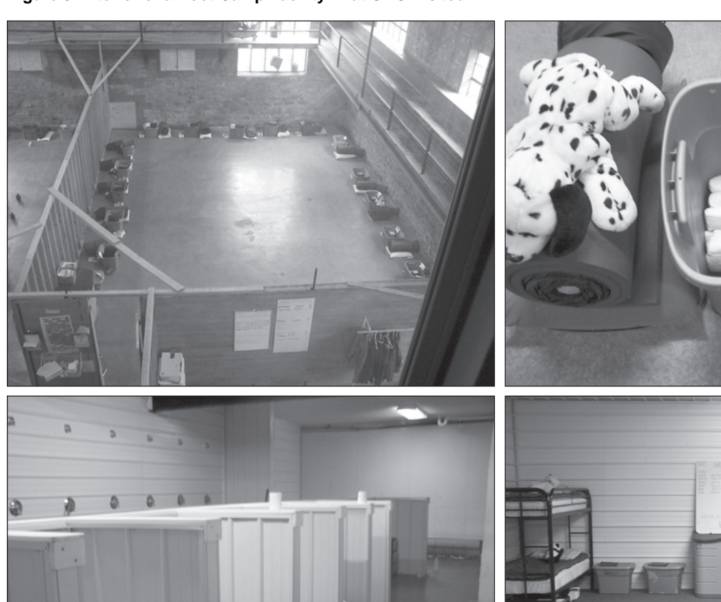
Figure 3: Interior of a Boot Camp Facility That GAO Visited