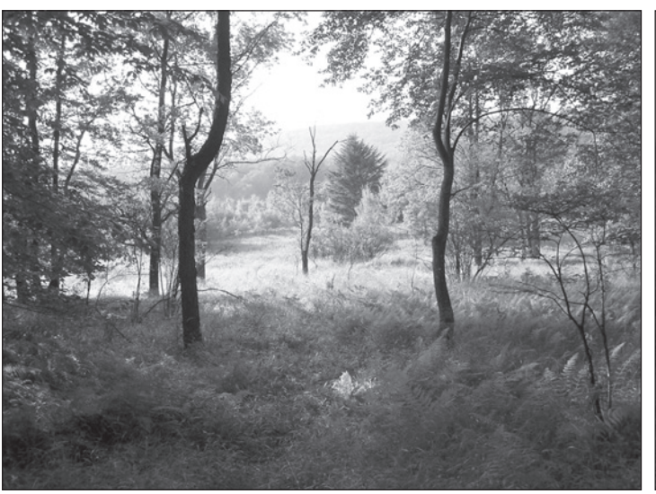
Figure 1: Environments Where Wilderness Therapy Programs Operate