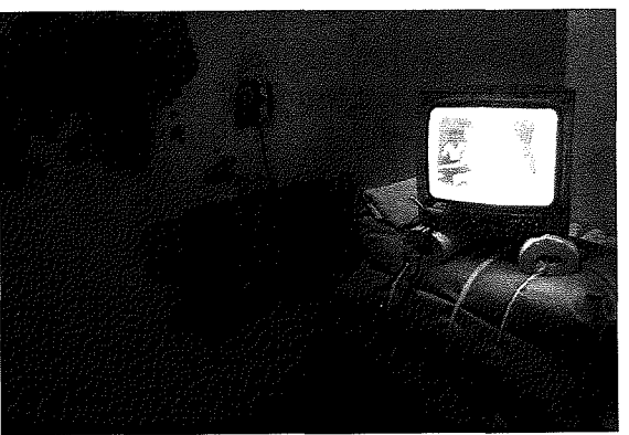
View of conditions in prisoner's cell shows where shelves have been ripped off the wall and an exposed electrical outlet.

box for any length of time without losing control."