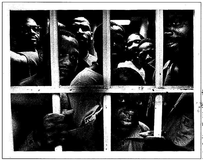
Imprisonment in the United States often includes brutal conditions and massive overcrowding.

We are spending over $16 billion a year just to operate prisons, which net a weekly increase of over 2,000 men and women. We need to build four new prisons each week to accommodate the increase at a capital cost of over $2 billion a month. California spent $6.2 billion on new prison construction in the past decade and the state's prisons are much more overcrowded today than 10