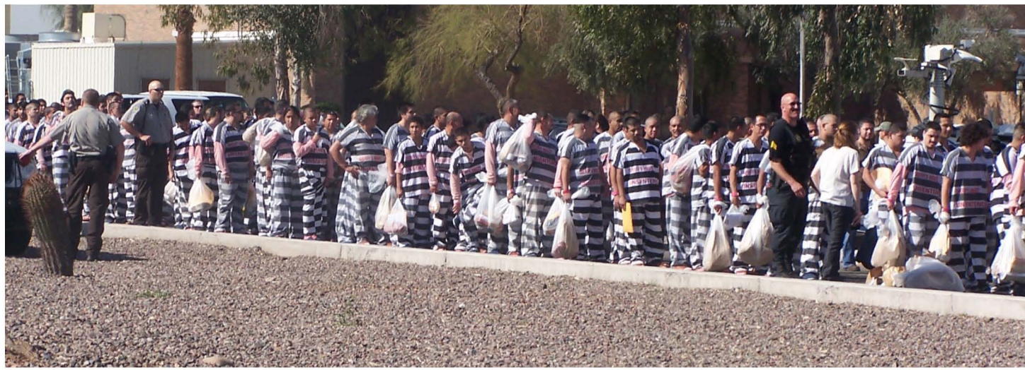
Maricopa County-Sheriff Arpaio marches immigrant arrestees into Tent City, a jail notorious for death and abuse.

In January 2007 the Maricopa County Board of Supervisors approved a partnership between the Maricopa County Sheriff's Office and ICE. One month later, ICE added 160 Maricopa officers to the 200 officers already deputized nationwide. 123 It was the first time that ICE gave local law enforcement officers both the power to arrest on the streets and to issue detainers in jail. 124 Although this was meant to be a groundbreaking project, the MOA was issued for an indefinite period of time. The ICE press release promised that the new powers would finally enable officers to "complete the processing of any criminal aliens and prepare the documentation to place those aliens in deportation proceedings." The Special Agent in Charge for Arizona promised the powers would be used to "combat the violence and crime that go hand in hand with illegal immigration."125