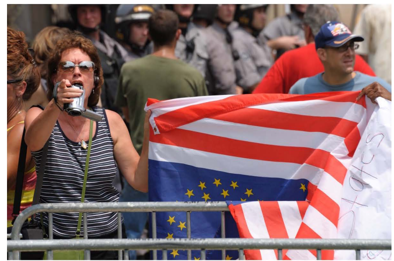
Anti-immigration protestor standing in the mayor's camp of Morristown rally.

For fear of deportation, WotS discouraged undocumented members from attending the rally. The group hosted a community forum in a local church, where local residents attended to learn about the 287(g) program and express concerns. Over the length of the campaign the group held