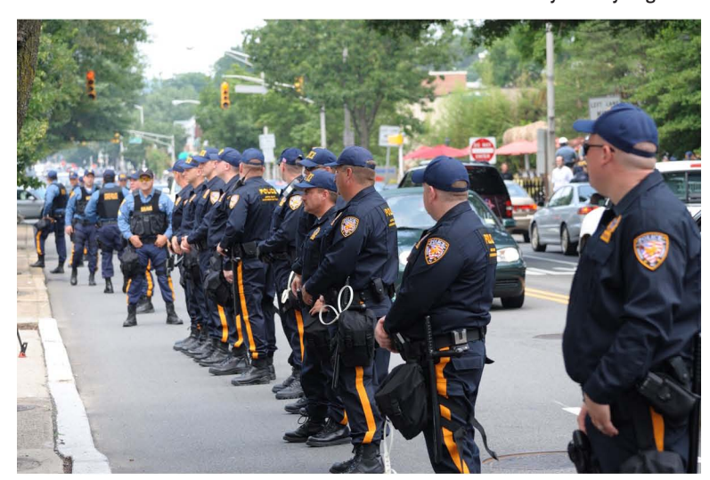
Police in riot gear dividing the sides.