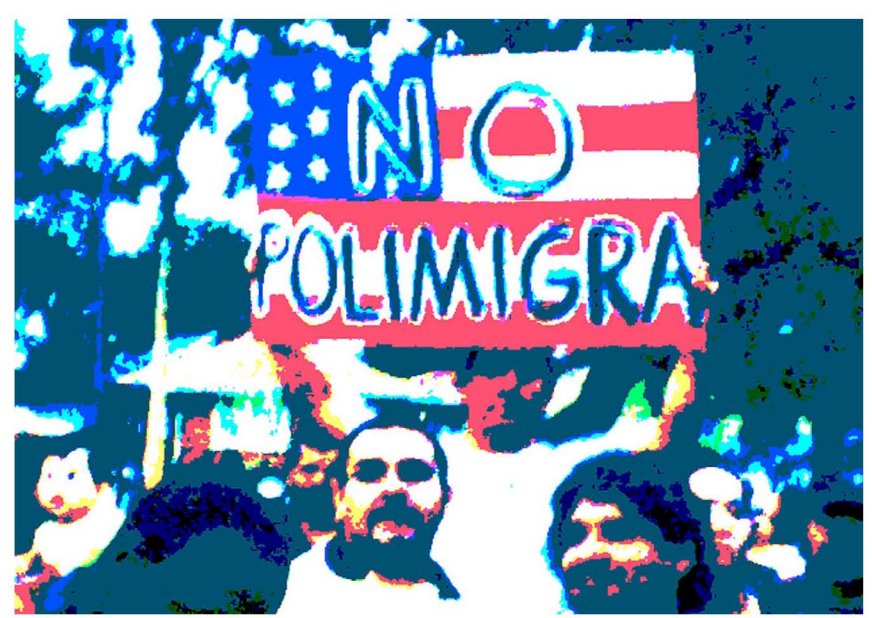
Waukegan IL - Protestor against 287(g) program holds sign that combines the English word "police" with "La Migra," the Spanish word for "Border Patrol."

undocumented detainees for a total of 1,023 billable days. He asked on his blog, "Why should Butler County taxpayers have to pay for jail costs associated with people we don't believe should ever have been in this country, let alone this state, or county, to begin with?" In 2006 he erected a yellow street sign outside his office reading "Illegal Aliens Here" with an arrow pointing to the adjoining jailhouse. He also posted six billboards in the conservative, blue-collar town warning, "Hire an illegal—break the law!" He took out half-page newspaper ads with the same message and started a tip line for people to report employers suspected of hiring undocumented immigrants.