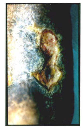
Magnification of the ulcer on the foot