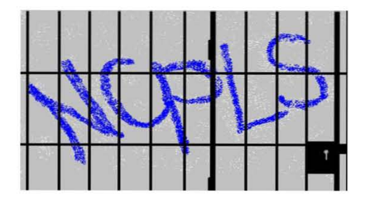
Visit our website at: http://www.ncpls.org

Phone: (919) 856-2200 Fax: (919) 856-2223 Email: tsanders@ncpls.org