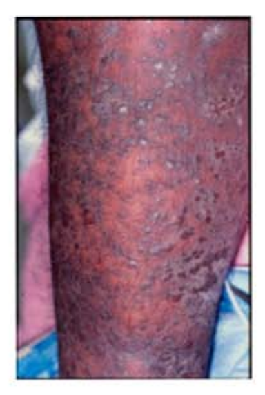
KS lesions on the leg

Kaposi's sarcoma (KS) is an unusual form of cancer that is characterized by the presence and growth of numerous lesions that develop on the skin or in the internal organs. KS is a cancer of blood vessel tissue, which results in tumors or lesions that are red, purple or brown in color and can grow to about the size of a half dollar. This same condition afflicted the character portrayed by Tom Hanks in the movie Philadelphia .