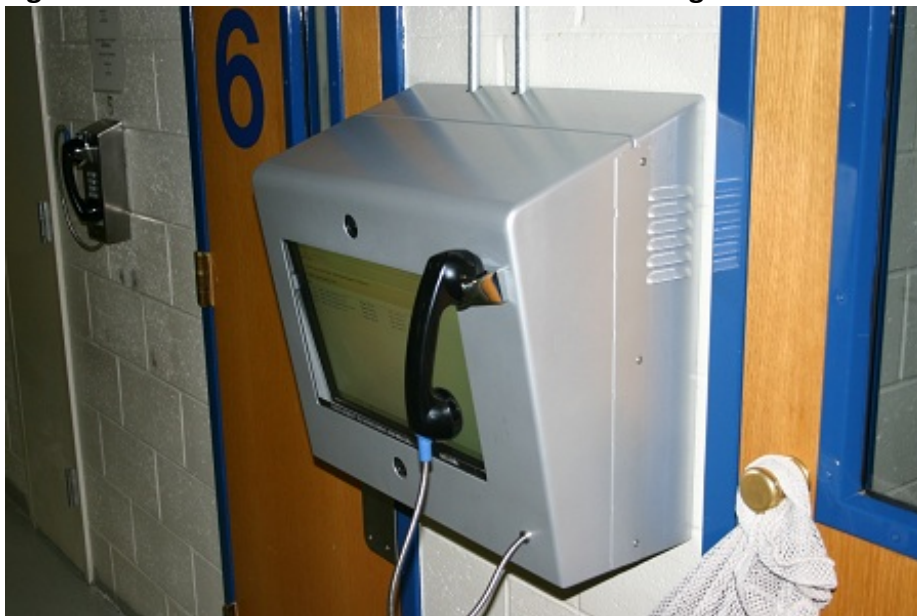
Figure 3. Web Visitation Console Installed in Housing Unit