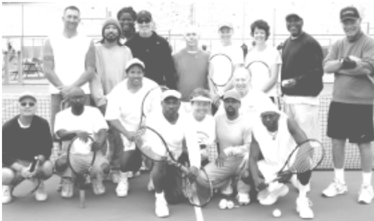
Inside Tennis Team with Brad Gilbert (Back row fourth from the left)

Last month Brad Gilbert came to San Quentin to visit with the Inside Tennis Team, giving pointers on how team members could improve their game.