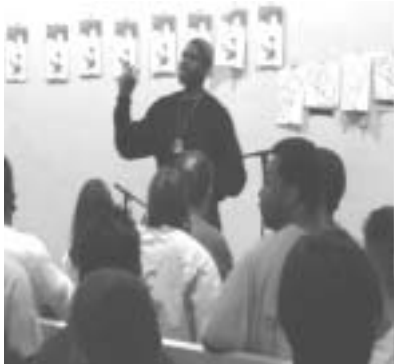
Preacher Teaching R/C Offenders

"In my working the Center, I've men why continued re- p r i s o n " "many of there's noth- for them. d o e s n ' t she added. F o o t m a n "Let me fix