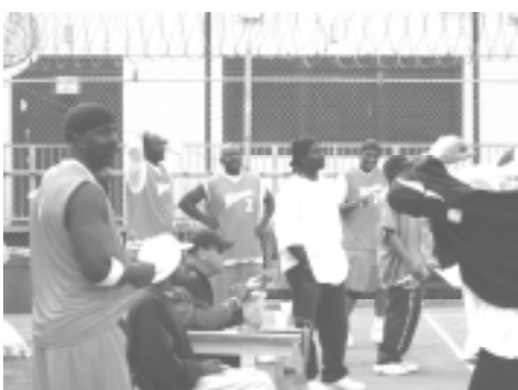
Saturday Morning Competition

team is open to any man with the right attitude, spirit and