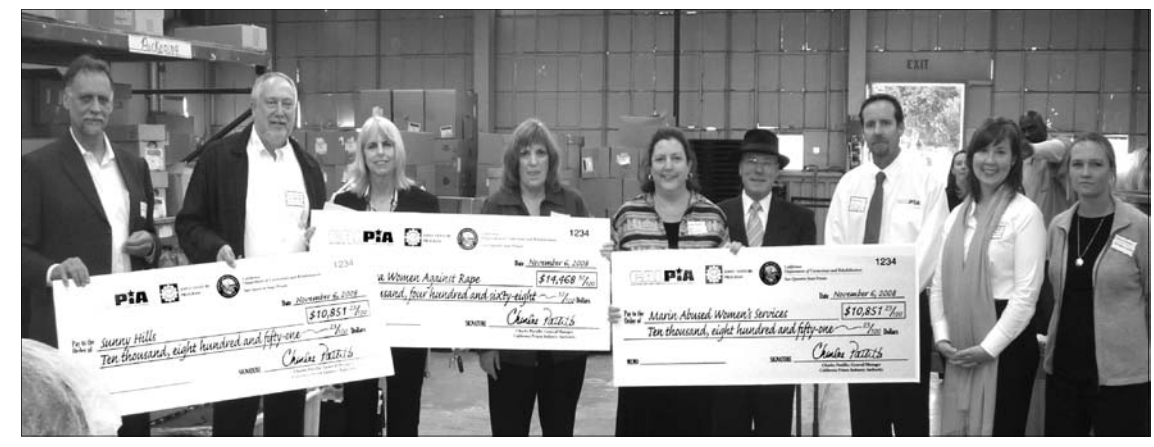
Community Development Associations receiving checks from prisoners and Joint Venture