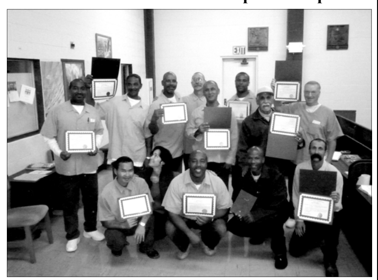
VOEG graduates with their diplomas